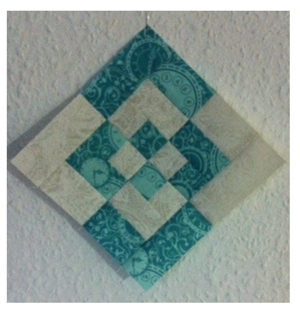
6" x 6" block

Please, refer to the diagram below for the following steps.